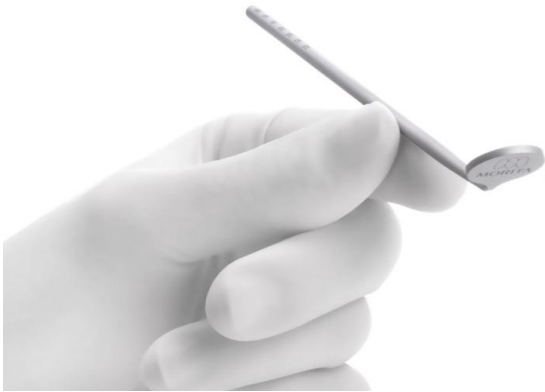
Fig. 3: Ergonomic instrument design for balanced working posture (oral mirror MXS, Morita)