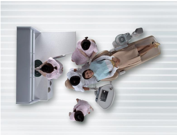
Fig. 1: Easy access to all instruments (Spaceline EMCIA, Morita)