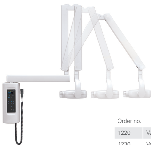
iX-WA wall-mounted version