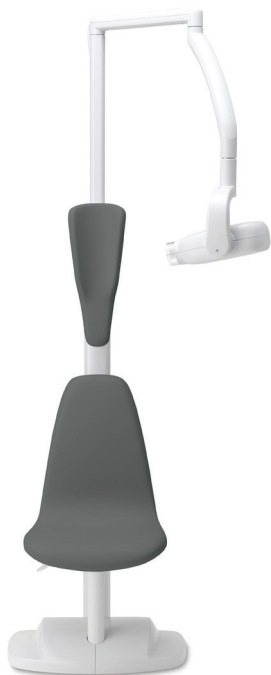
iX-R version with patient's chair