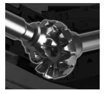
Highly durable involute gears

Unique, multi-point chuck MORITA's unique chuck design grips the bur firmly and doesn't lose its strength even after years of use. Experience the stability only a TORQTECH can provide when performing work that requires great precision.