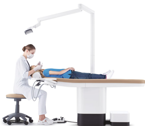
Fig. 4: The simple height adjustment makes the Signo Z300 ideal for pediatric treatment.