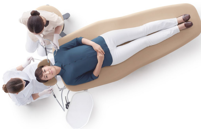
Fig. 2: Ideal and flexible for two- or four-handed treatment.