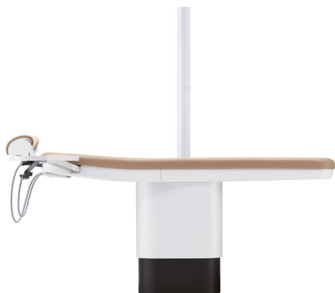
Fig. 1: Timeless, minimalist, and graceful – the Signo Z300 from MORITA.