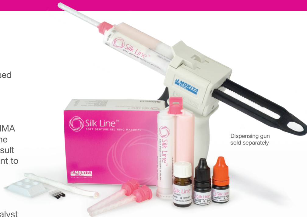
Dispensing gun sold separately

The Silk Line Kit contains a varnish catalyst and a varnish base. The varnish can be used in the final polishing step to smooth the trimmed borders of the denture, if desired. The base and catalyst are mixed together in a 1:1 ratio, brushed onto the denture, and allowed to dry at room temperature for approximately 5 minutes.