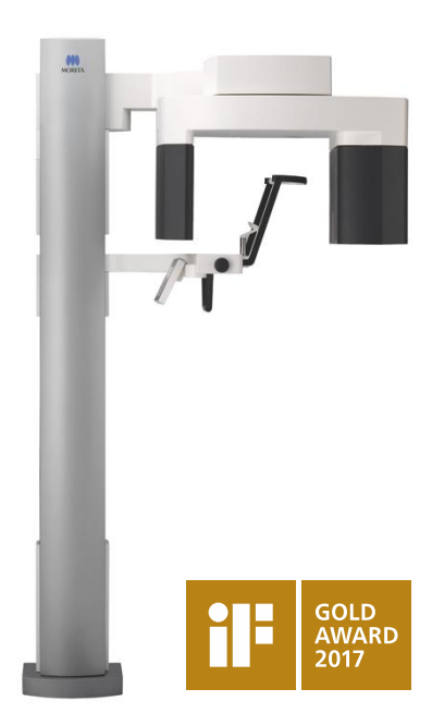
Fig. 1: Veraview X800, which won the iF Design Award, is forging a new dimension in image quality