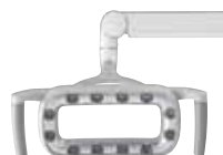
Luna Vue EL II Light (12 LED)