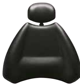
G10 Gloss Black (G10 GB)

The Signo G10 II incorporates further scope to customize the appearance of your treatment unit with 2 new trim options (tray and base sections). This combined with multiple upholstery and basin colour options ensures your Signo G10 II will fit perfectly into your practice with maximum appeal.