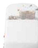
Bacteria filters (water and air)