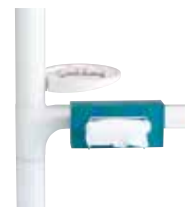
Small tray mounted on light pole Tissue box holder (Over arm type)