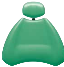
G10 Fresh Green (G10 FG)