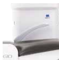
Armrest Assistant's side