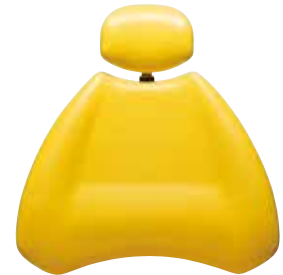
G10 Splash Yellow (G10 SY)