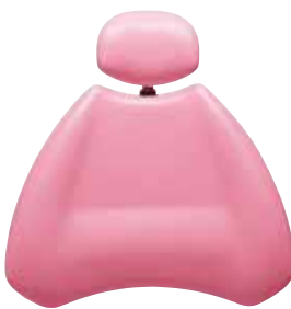
G10 Honey Pink (G10 HP)