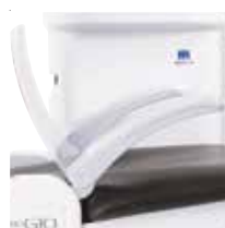
Movable armrest Dentist's and Assistant's side