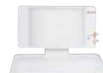
Triple viewer (PFV95LD)