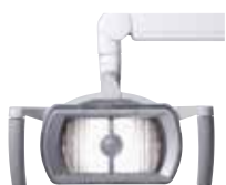
Luna Vue ES Light (Single LED)