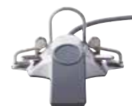
Foot controller (Extended function with lever) (FC201A)