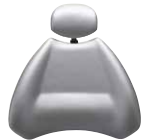
G10 Shiny Silver (G10 SS)