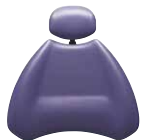
G10 Cool Violet (G10 CV)