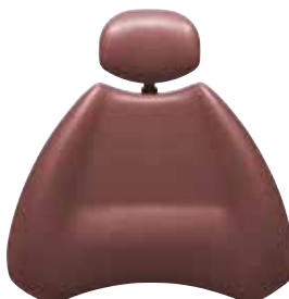
G10 Sweet Brown (G10 SB)