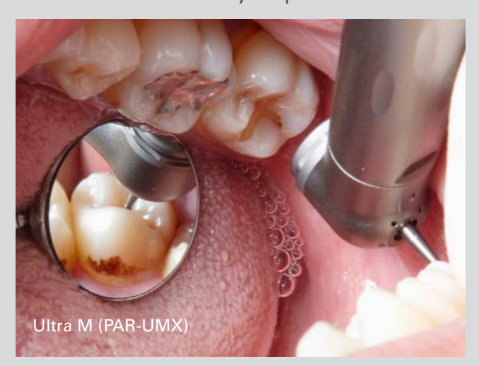
Case 2. Tooth 17 Cavity Preparation

When using a standard sized head, the bur must be slanted for visibility which results in removal of more tooth structure than necessary.