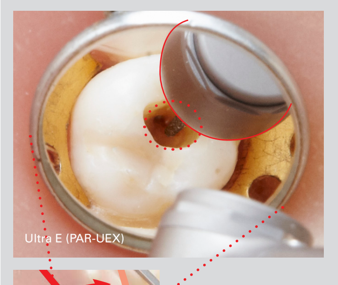
Case 1. Tooth 16 Pulp Chamber Opening

The Ultra E head facilitates an improved view with a mirror or a microscope.